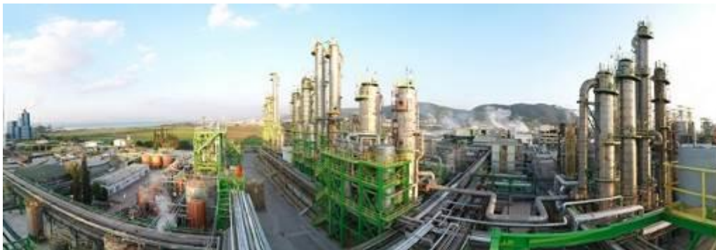
(PM_MDT_AKSA2.jpg, PM_MDT_AKSA3.jpg – © by AKSA) AKSA plant in Yalova (Turkey) - one of the largest production plants for acrylic fibers worldwide.